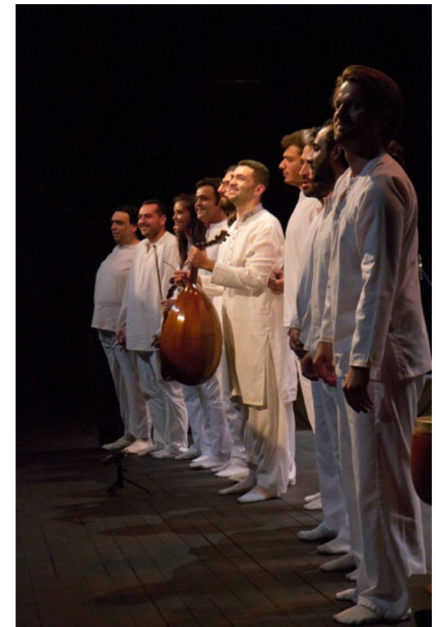
Ruba'eyat el Khayyam - Madina Theater, Lebanon, 2012