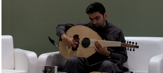
Concert and artist talk - Abu Dhabi Book Fair, UAE, 2017 and 2018

26 April — 2 May 2017 26 أبريل – 2 مايو 2017