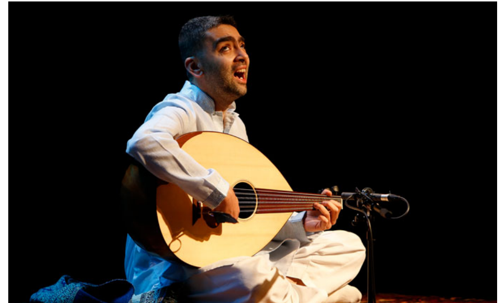
Oud Recital - Labyrinth Catalunya - Cardadeu, Spain, 2019