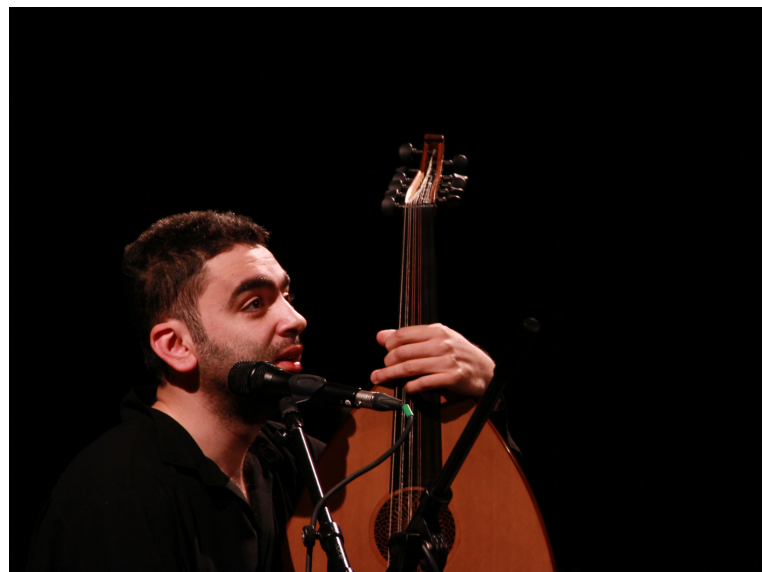
Oud Recital - Japan Tour - Fukushima, Fuji, Tokyo - Japan, 2011