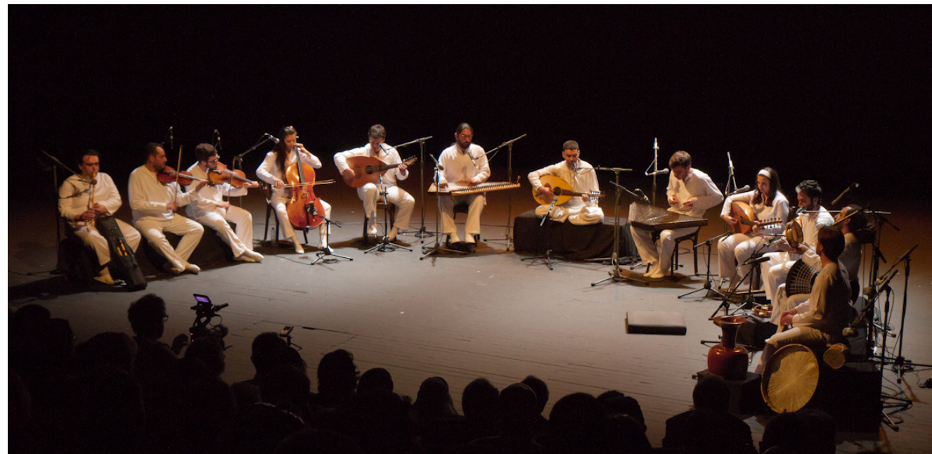
"Autism" premiere concert for ALBEDO creative art platform - Monnot Theater, Lebanon, 2016