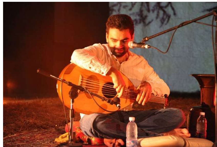
'US the Moon and The Neighbors' Festival - Beirut, Lebanon 2013