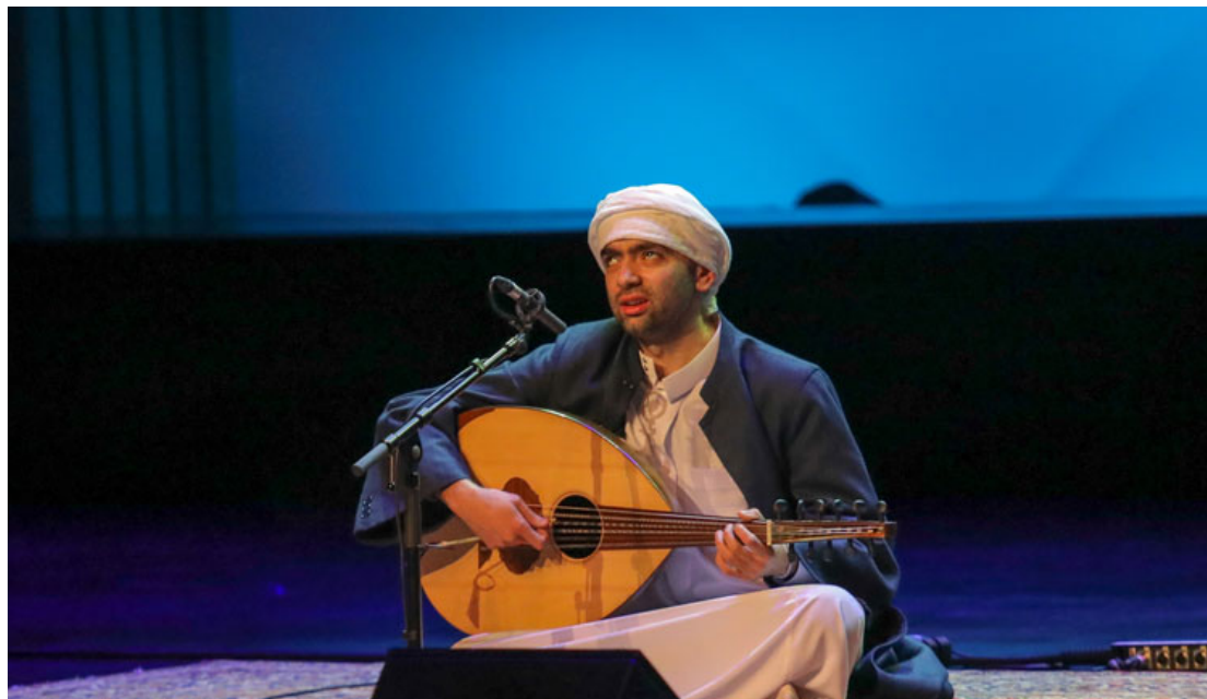
Aga Khan Music Award Concert, Winner for Best Music Performance - Lisbon, Portugal, 2019